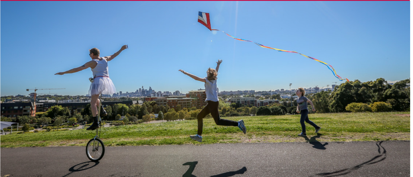
Sydney Rides Festival