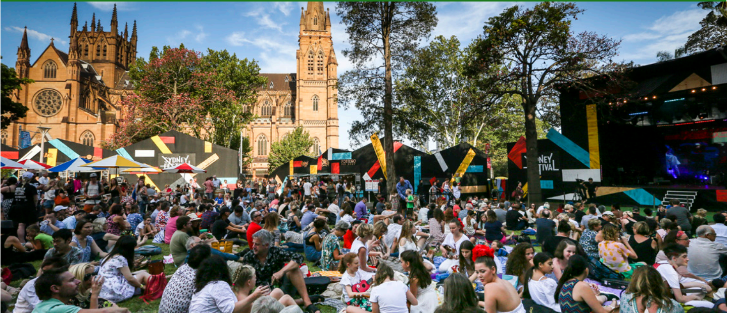
City of Sydney was a proud sponsor of the Sydney Festival 2017. Photographs of sponsorship and marketing material