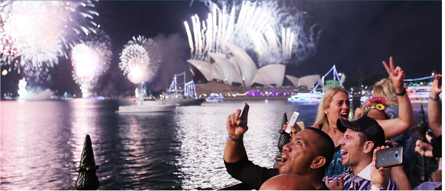
Crowds pictured at Dawes Point during the New Year's Eve fireworks, 2015

The following information that should be included on a dedicated event website: