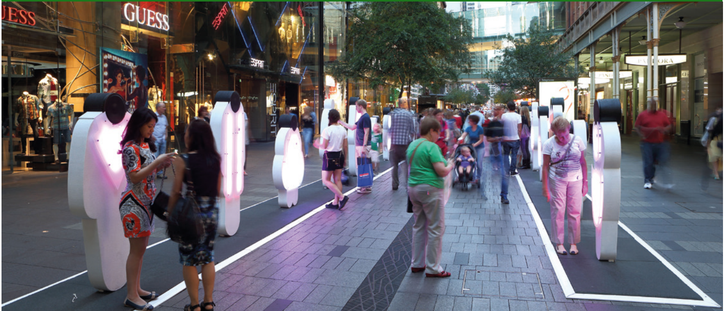
People interacting with the Infinite Choir at Pitt Street mall in the Sydney CBD. The Infinite Choir was set up as part of the Sydney Christmas events 2013.

In addition, the portable wheelchair accessible toilets at outdoor events must be: