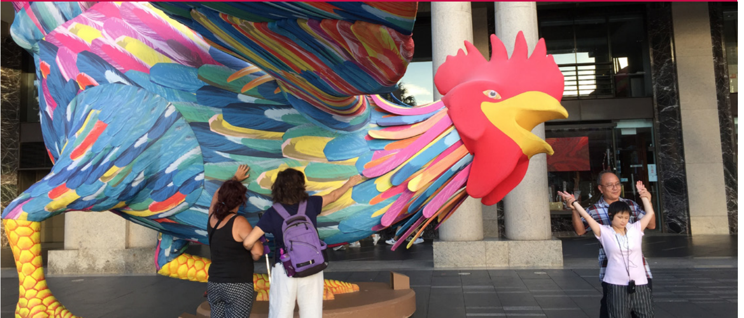
Photographer: Joanne Chan