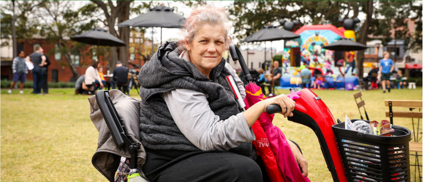
Good Neighbourhood BBQ in Foley Park Glebe, August 2018

The City of Sydney has a publicly available list of designated on-street mobility parking spaces on our website .