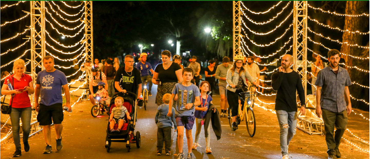
City of Sydney Cycling and Walking team presents 'Light the City'.