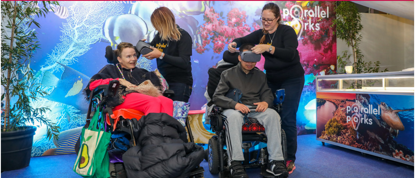
Parallel Parks. People explore the Great Barrier Reef at Customs House Library using Virtual reality headsets