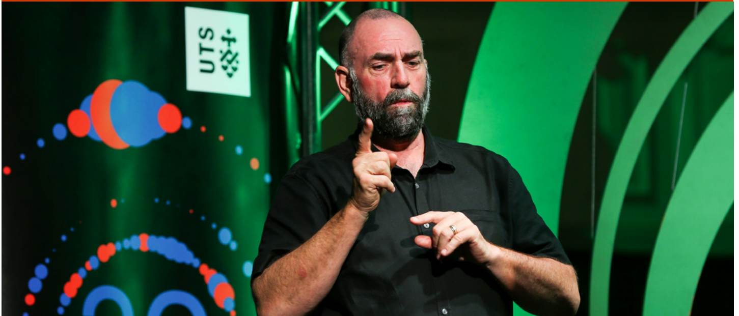
City Talks featuring Auslan interpreter