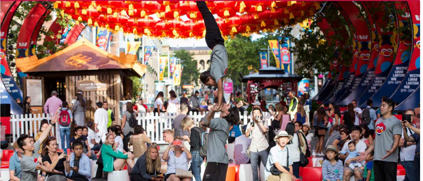
Chinese New Year 2017