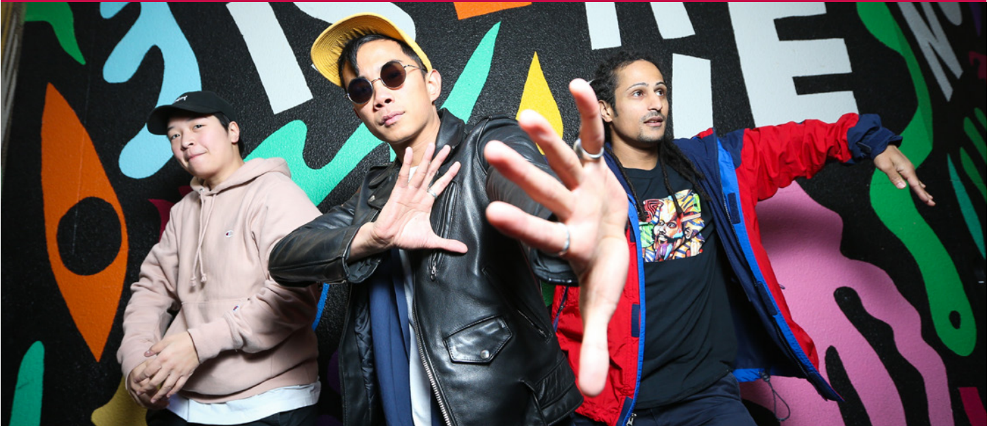
Destructive Steps - Street dance competition 2017