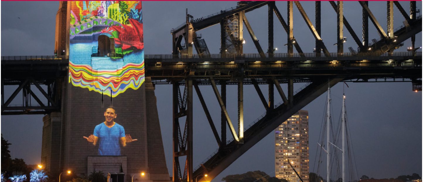
Sydney New Years Eve 2016. Auslan interpreter projected on to Sydney Harbour Bridge Pylon